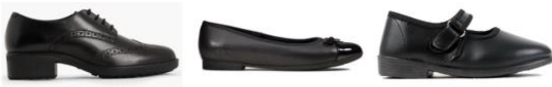
Girls – Acceptable Footwear