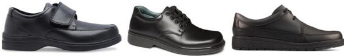
Boys – Acceptable Footwear

Shoes can be bought anywhere, but have to comply with our requirements for footwear – black, formal shoes only. No trainers please; these should only be worn with PE kit).